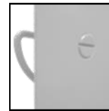
Standard Cam Latch